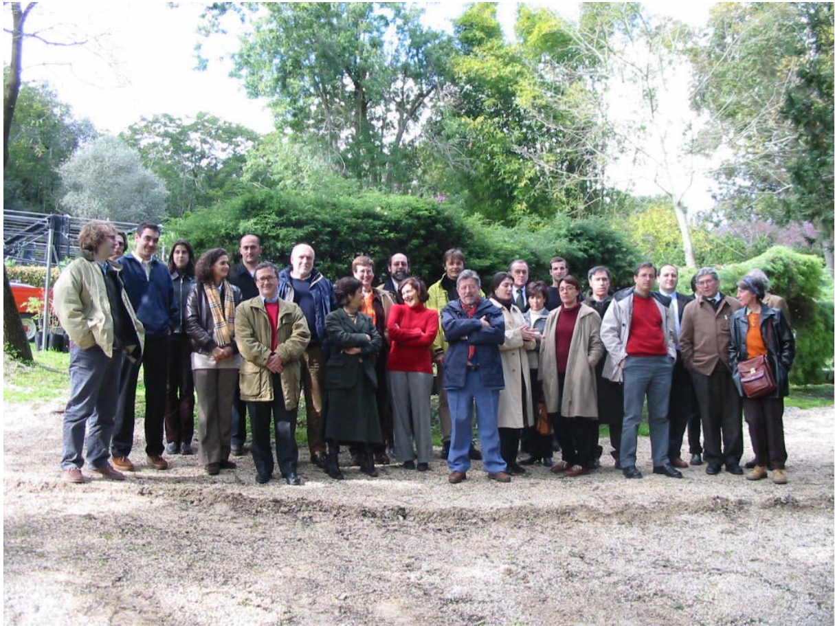
Photo de groupe